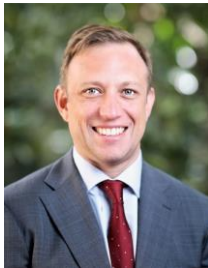
The Honourable Steven Miles MP

It is crucial that we embark on this next stage of reform in partnership with people with disability, their families and the disability sector and that is why we will now turn our focus to engaging and co-designing reforms with our partners.