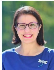
The Honourable Charis Mullen MP

Minister for Child Safety Minister for Seniors and Disability Services Minister for Multicultural Affairs